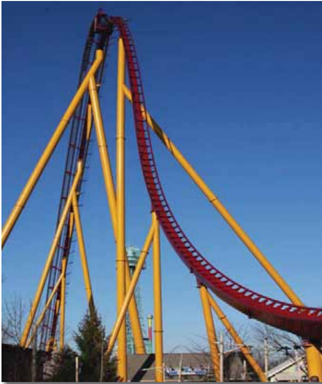
The Diamond Back