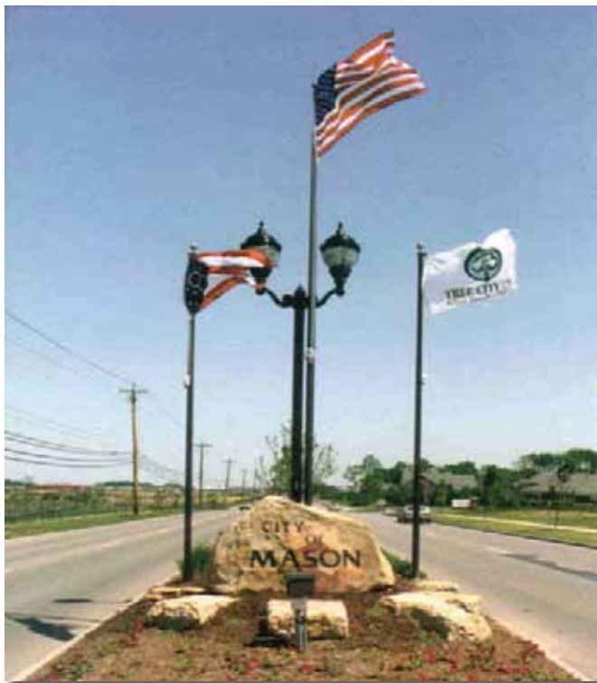
Mason’s manicured boulevard treatments and streetscape investment along primary thoroughfares enhances community image and creates a welcoming appearance.

Maintain and enhance Mason’s strong aesthetic image at key entrances and along thoroughfares. See CF-5.1.3.