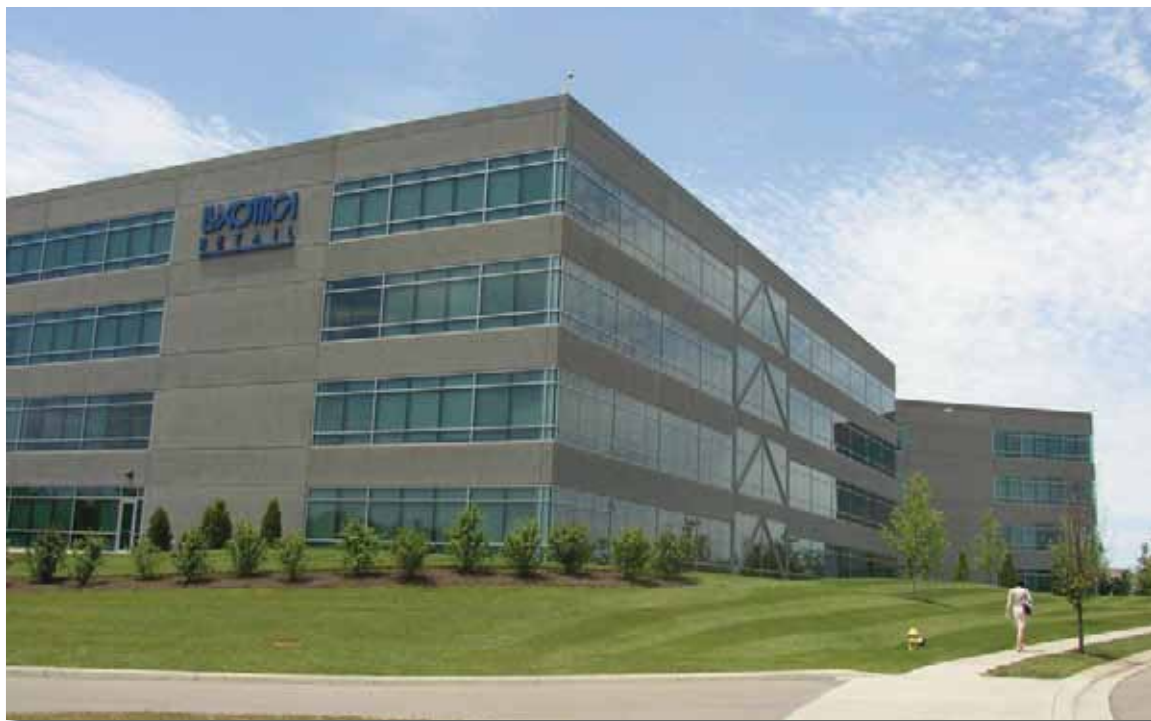
Luxottica Office Building at Tylersville and Western Row Road