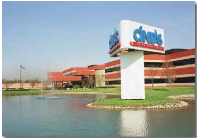
Cintas maintains a large educated workforce at its Mason campus.

Action ED-5.2.6. Enhance the streetscape and gateways in each district so as to reflect the established theme and provide stronger physical connections to other districts. Include wayfinding elements that direct motorists and pedestrians to key destinations. See CF-5.1.3, CF-5.1.5 and ED-7.